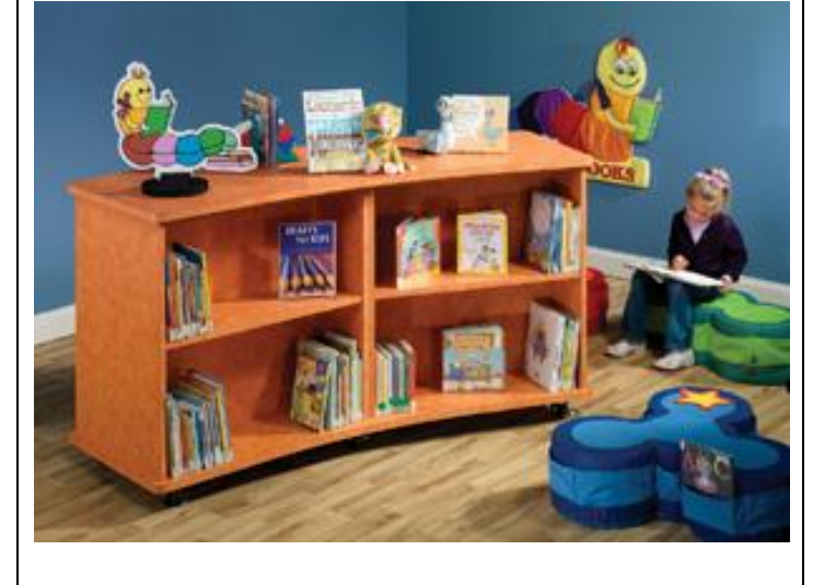
Junior Library Shelf