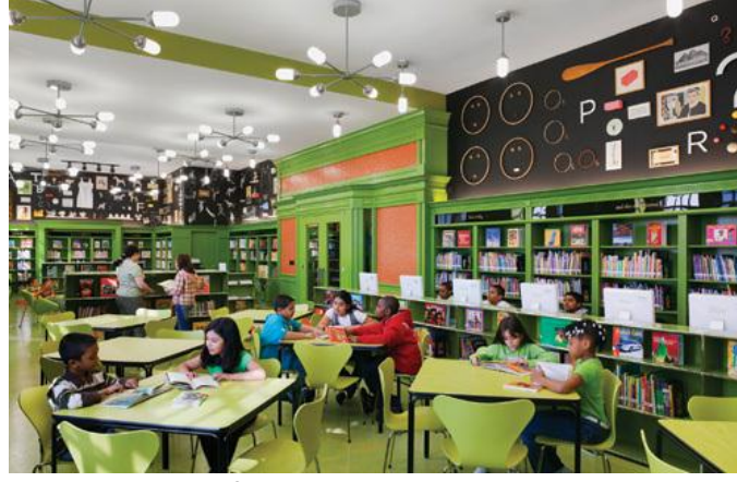
Wall fixtures, lighting and ceiling