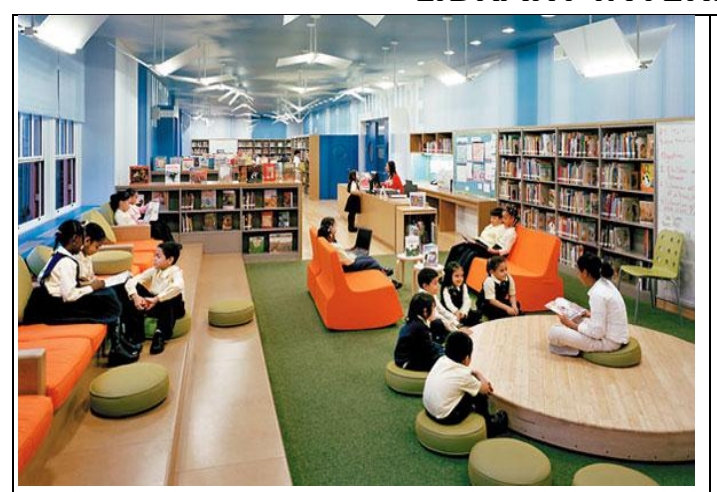
Storytelling and casual reading areas