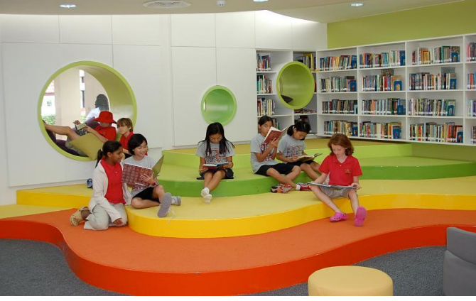
A modern Junior Library