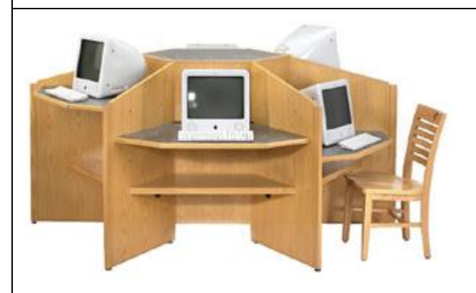
Computer work stations