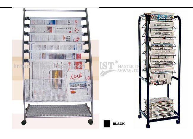
Book trolley Magazine Stand (revolving)