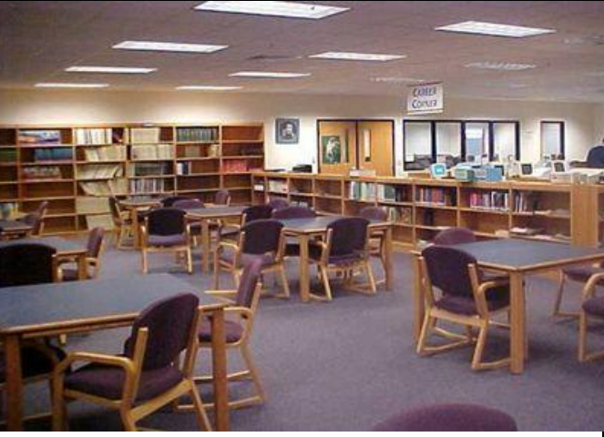
Cushioned wooden chairs, coloured table tops, carpets